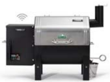
TREK PRIME WIFI - STAINLESS

$2000 from Buck Creek Comm. Assoc. 65" TV from Nutrien Ag Solutions Trek Pellet Grill from A Fire's Place Value $399